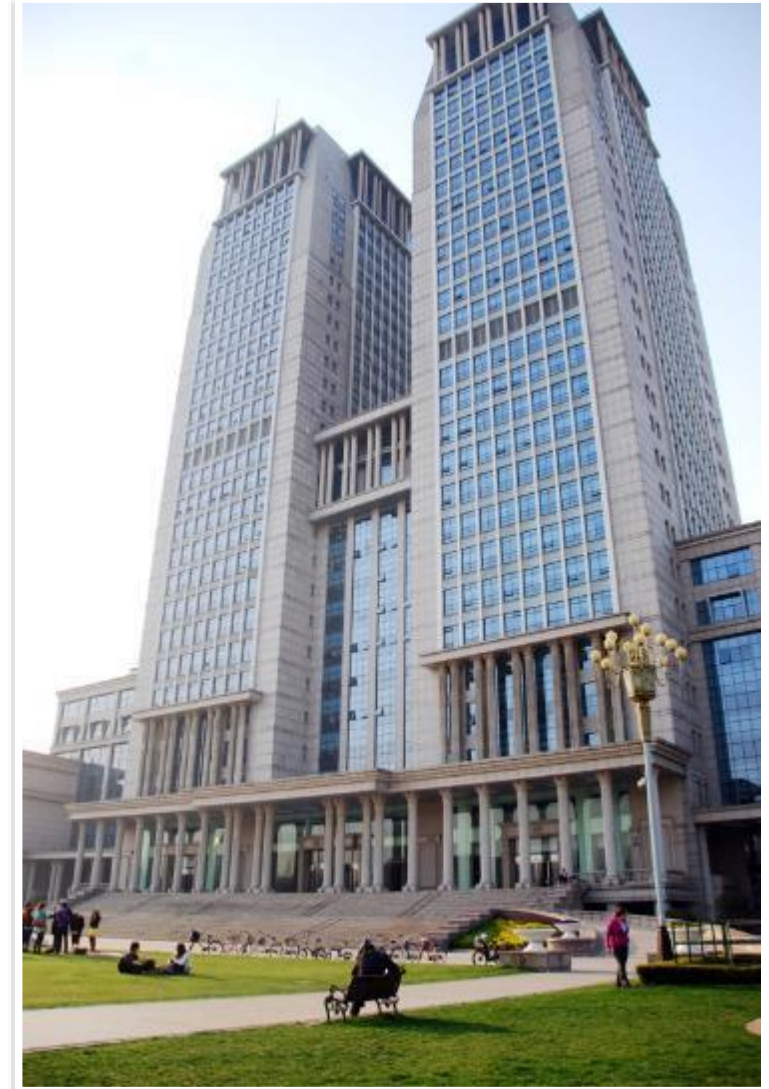
Guanghai Towers in Fudan University

FOR MORE INFO: http://www.fudan.edu.cn/englishnew/