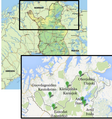
Figure 1: Map of Northern Europe, with the inset showing the data collection sites for this study.

rently, there are about 30.000-40.000 Sami speakers, but some Sami languages have already disappeared and some have only a few speakers left [18, 19]. North Sami is the biggest and most widely spoken of the Sami languages, with about 20,000 Sami speakers. It has become a kind of lingua franca among the Sami speakers, used e.g. in news broadcasting.