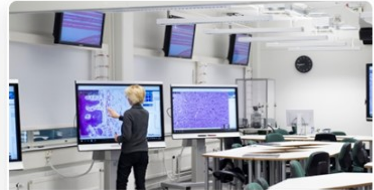
Your Institution's Courses