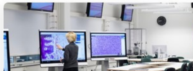
Your Institution's Courses